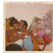
What's my name? (family photo), 1977 173

Each page is an act of time travel, a mosaic of full-bleed images and thumbnails that encourages dialogue between different moments in Carter's career and draws parallels to the 1970's fashion and palette captured in his mother and father's snapshots. In one spread, a snapshot of a boy cloaked in a bright yellow barber's cape poised as a woman shaves his hair—shot for Baby Boy , a collaboration between Carhartt & Manual NYC—is paired with a polaroid from 1982 of a youth sports team, boys huddled around their coach dressed in yellow jerseys and striped knee-high socks. In another, a cluster of school portraits taken between 1965 and 1972 is juxtaposed with a photograph of the back of a woman's head—her hair ornamented with multicolored berets in the shape of butterflies, horses, and bows. With Carter as their nexus, these images communicate across time, lives, and communities, celebrating the great dimension of black identity in America through the medium of photography.