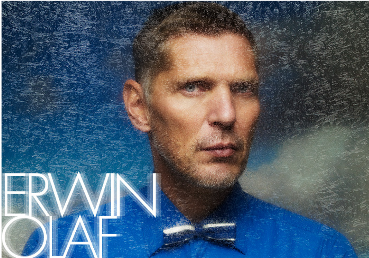
Portrait by Feriet Tunc

Male Olympic gymnasts, take note: if you lose during competition, invite Dutch photographer Erwin Olaf onto the floor and he will gladly be your shoulder to cry on.