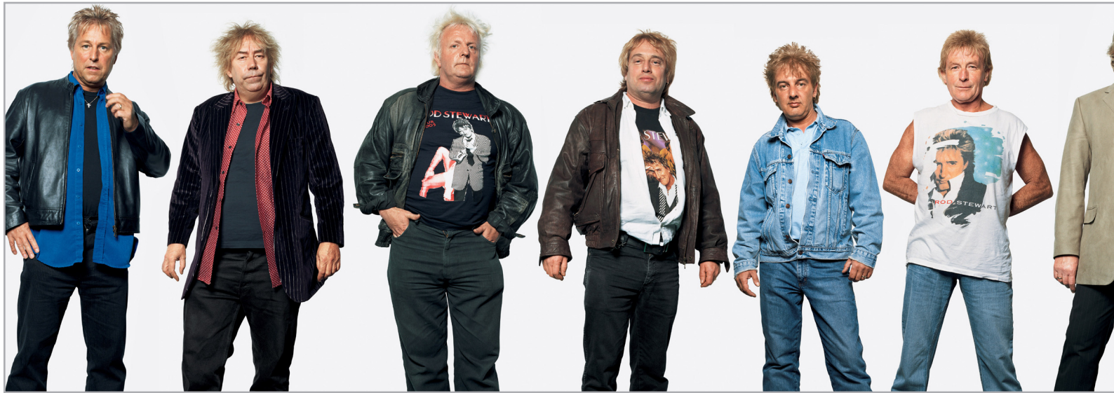
Rod Stewart (Concert), Earls Court, London, 2005