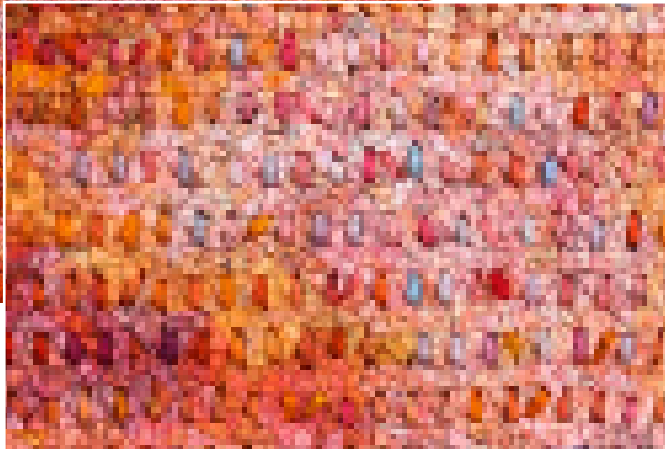
Kwang Young Chun, Aggregation14-AP018(Dream 5) , 2014, Detail

Since the inception of Chun's Aggregations , the artist has meticulously constructed these striking, textured compositions by affixing hundreds of hand-cut polystyrene triangles, each one individually wrapped in Korean mulberry paper ( hanji ), to canvas, plumbing the sculptural potential of ostensibly two-dimensional wall works. In the newest iterations of these hypnotic, visually baffling creations, rippling, sensuous exteriors fuse