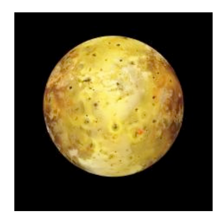
Io, one of Jupiter's moons, is the most volcanic object known to man, with at least 200 contstantly erupting volcanos.

Benson selected the images from five decades of robotic space probe photography, beginning with the lunar orbiters of the 1960s to probes that are still sending images back to Earth today from Saturn and Mars.