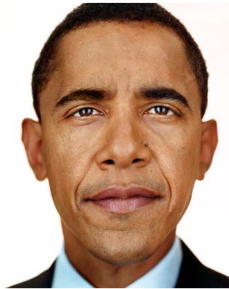
Barack Obama, 2004

When shooting these portraits, Schoeller tries to make his subjects forget, just for a second, that they're being photographed - capturing that off-