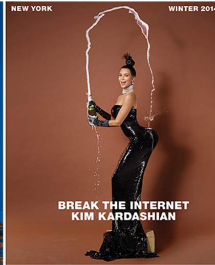
Paper Magazine Cover, November 2014