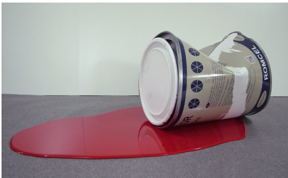
Macro X, 2012